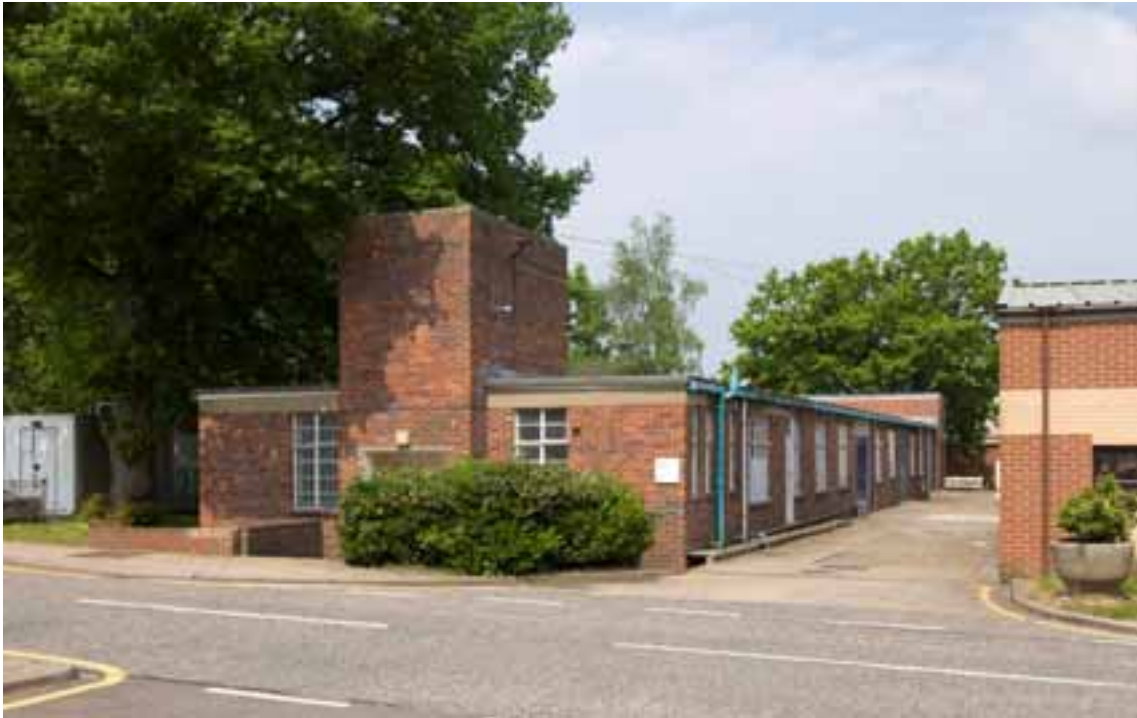
Figure 12: Wartime building Q1 later incorporated into the HER enclave.

standard concrete framed and asbestos roofed Ministry of Supply hutting was erected for office accommodation. Immediately to the west of Q1 three now demolished huts, Q17, Q18, and Q19 housed the team's drawing offices. To the north of Q14 hut H6 remains and is now used as a café.