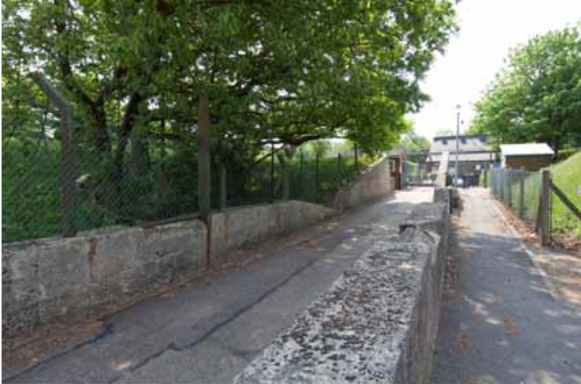
Figure 3: The main entrance to the Mobilisation Centre, to the left are traces of the fortress fencing and to the right part of the rampart has been removed to create a separate pedestrian entrance.

Beyond the fort a map reproduced in Neill Griffiths' typescript history (1984) shows trench works to the south of the fort. It is not clear if the entrenchments were dug in the 1890s, or if they marked a line to be dug in the event of hostilities. The scheme was partially revived during the First World War and some trenches were dug. A cropmark has been plotted to the southwest of the fort (TQ45NE21), this may represent the line of a trench or an earlier feature. There is also a linear earthwork above Pilgrims Way, leading to the North Kent Business Park, this may represent a former hedgeline.