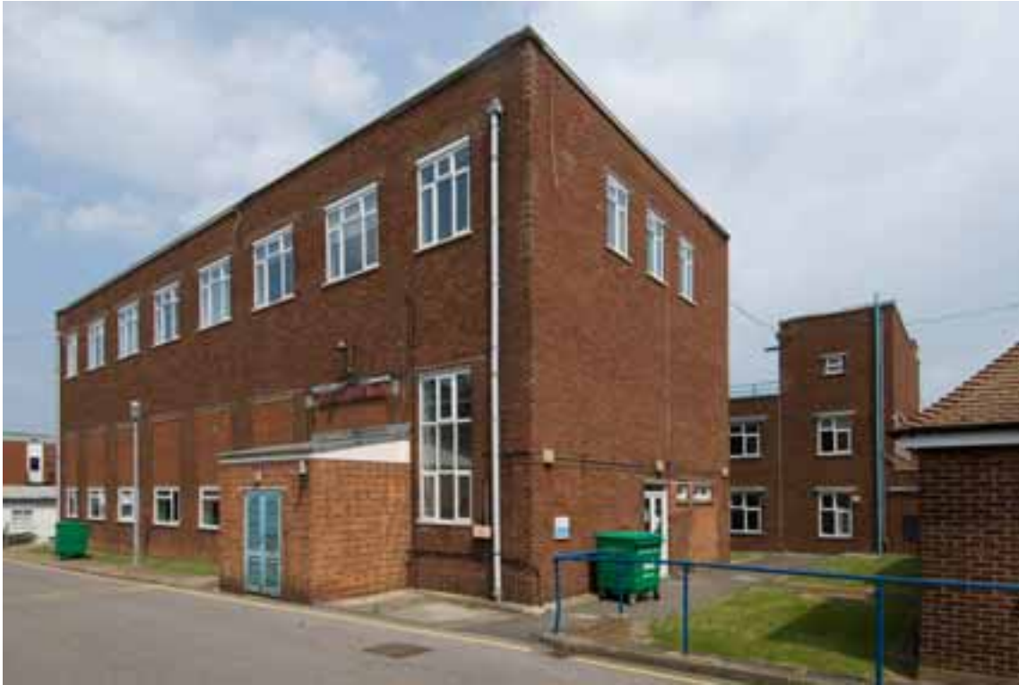
Figure 13: Building Q14, to the right is its former main entrance and to the left the plant room marks the position of the entry into the workshop. This building was specially designed for the assembly of Britain's first the prototype atomic bomb.