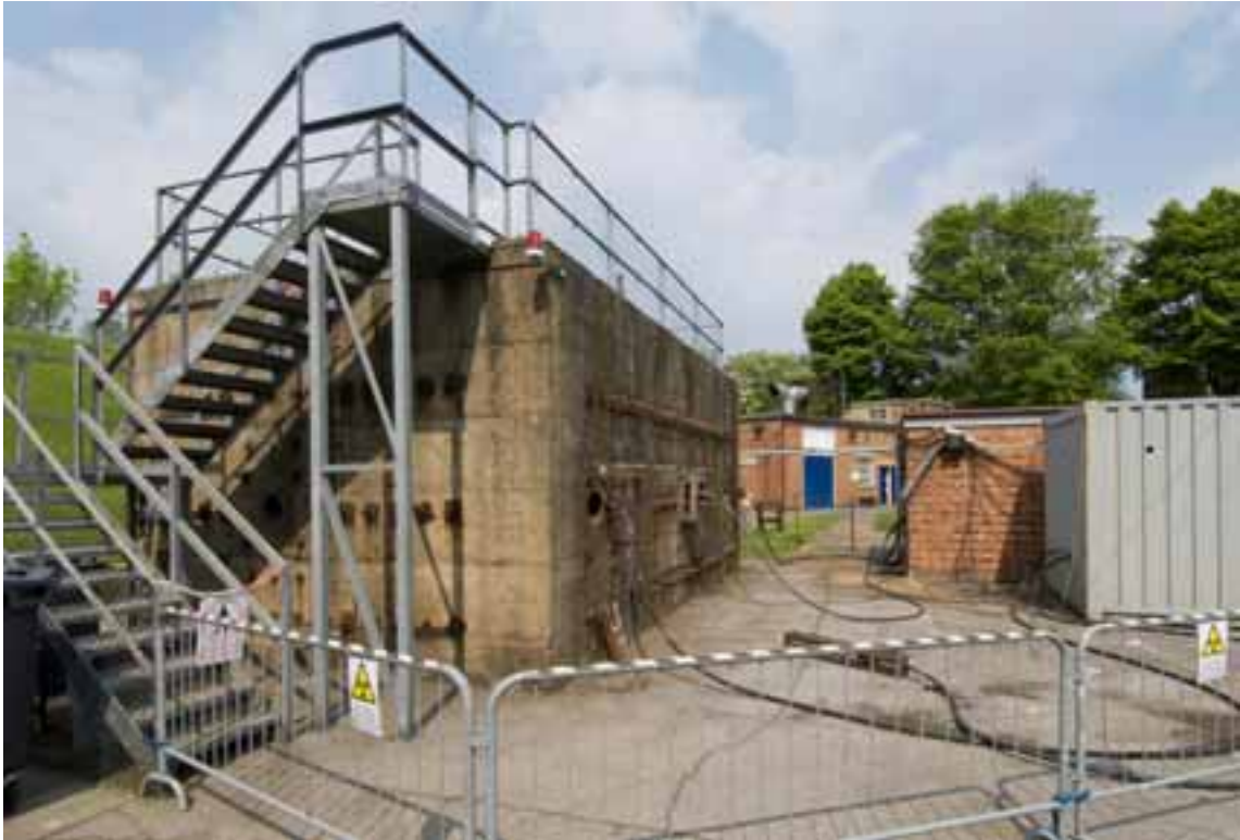
Figure 7: Bomb chamber F16 designed in July 1947. © English Heritage DP060586