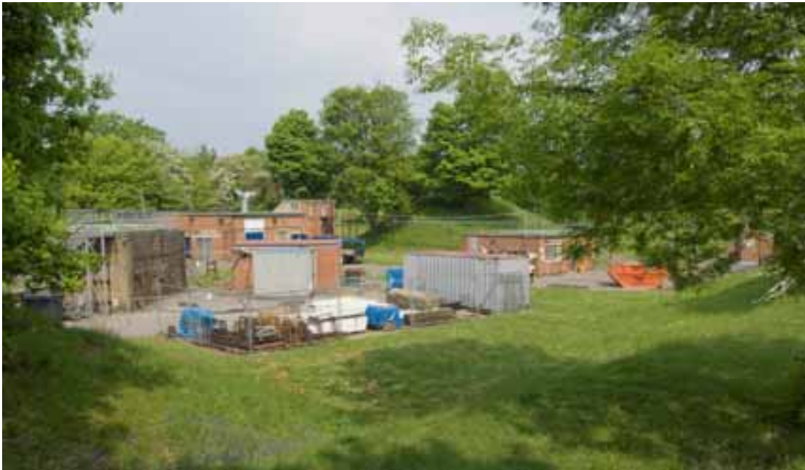
Figure 6: The eastern side of the Mobilisation Centre showing the buildings built for the High Explosives Research team, a scene little changed from the late 1940s. To the left is the Bomb Chamber F16, in the middle ground the Recording Laboratory F18 and to the left rear the Detonation Chamber F17.

Both to ensure the secrecy of the work and safety of the surrounding buildings the mobilisation centre was used for the testing of the bomb's electronic detonators. Within its bounds the casemates (F4 and F8) and existing buildings were also adapted for use as workshops and stores. While in the eastern half (Figure 6) of the centre a number of purpose built structures were constructed to support the work of William Penney's atomic bomb team. The principal buildings are the bomb chamber (F16) (Figure 7), detonation chamber (F17) (Figure 8) and a recording laboratory (F18), other smaller buildings in the fort may also have been associated with this work.