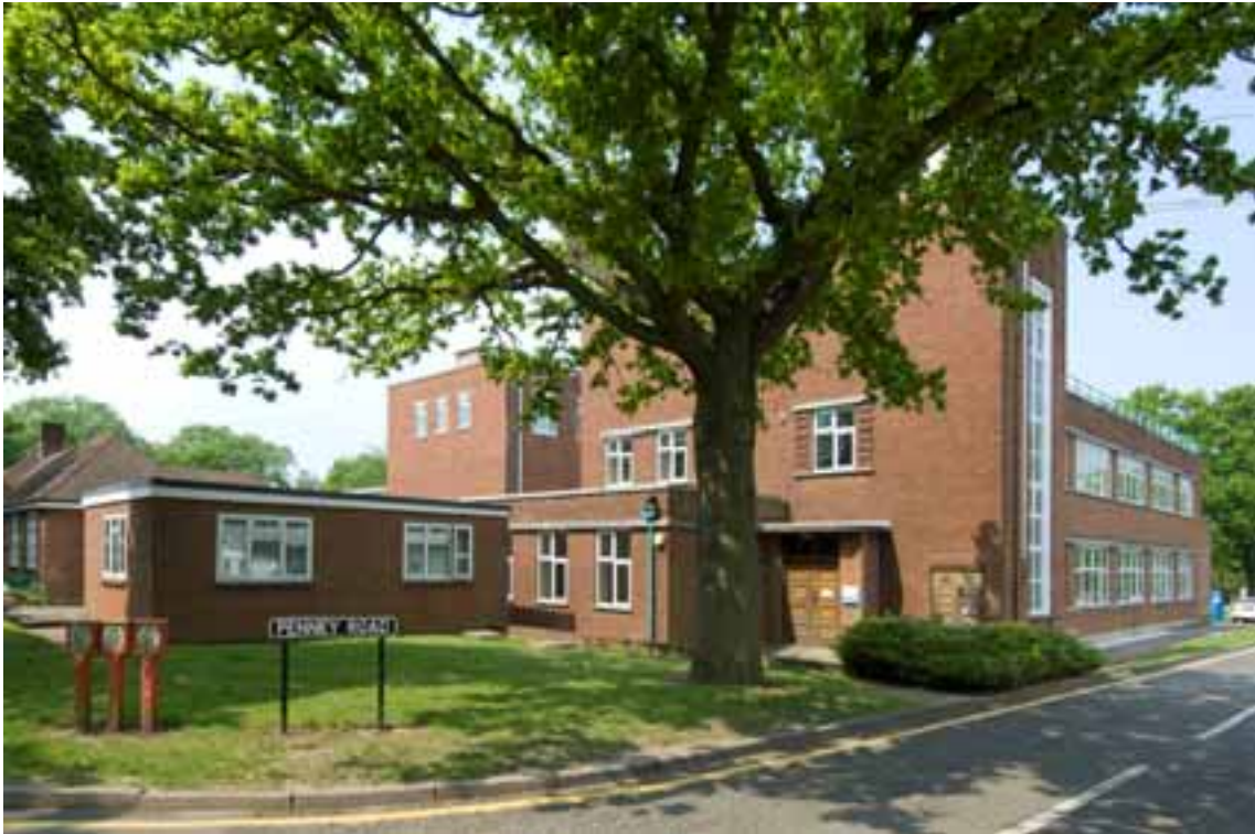
Figure 11: Laboratory Q13 built about 1939, in the foreground is one of the trees from the original planting scheme. To the left is A12.

identify buildings constructed during this critical period in the late 1940s. The boundary of the area occupied by Penney's team is taken from Clive (1997).