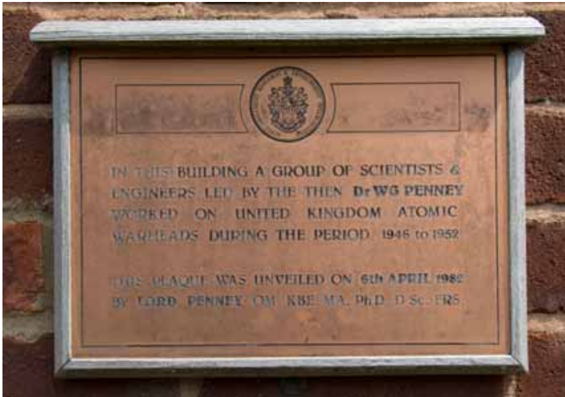
Figure 14: Plaque on the side of building Q14 commemorating its association with William Penney and the HER team. © English Heritage DP060630

Many aspects of the manufacture and testing of Blue Danube trials rounds still remain imperfectly understood. As mentioned, responsibility for the development of the bomb's casing lay with the Royal Aircraft Establishment (RAE), Farnborough, while HER, and the RAF team, was responsible for its internal devices. Most of the casings were manufactured by Hudswell Clarke and Co Ltd, Leeds, while the Percival Aircraft, Luton (Gowing 1974, 179) also played an important part in the design of the sphere that contained the high explosives and fissile components. Some of its internal electronic components were manufactured at HER's Woolwich Common factory, while others were probably produced by a number of private companies. The discovery in 2009 at the former Royal Ordnance Factory at Elstow, Bedfordshire, of a concrete dummy mimicking the high explosive elements of the bomb, may suggest it was also involved in the early phases of the project. Given its proximity to Luton it may have been used for the trial assembly of the core's metal casing.