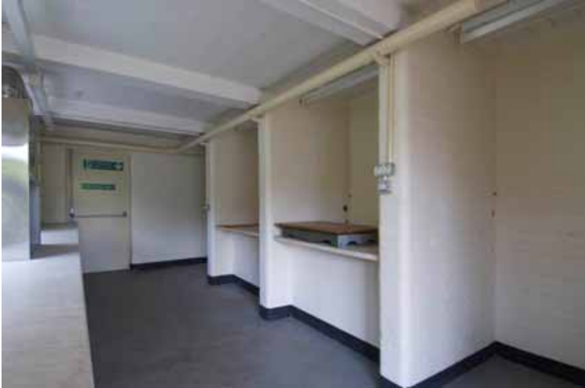
Figure 5: Experimental filling shed FI 1, showing the vertical filling bays.

which probably gave access to emergency escape ways. There is some doubt if this building was ever used for its intended function (Griffiths 1984, 4). Nevertheless, this modest building represents the earliest surviving purpose-built rocket related building in England and Britain's first steps to manufacture modern missiles. It is directly associated with this pioneering work by Sir Alwyn Crow that led to Unrotated Projectiles (rockets), which were widely used for anti-aircraft defence, coastal bombardment, and air-to-surface attacks, notably during the D-Day operations.