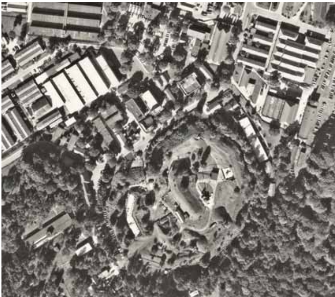
Figure 1: Fort Halstead, Kent, showing to the bottom the late 19th century Mobilisation Centre and to the top left part of the area occupied by the High Explosives Research team. English Heritage (NMR) MAL71144 5 October 1971 124

Fort Halstead (TG 4990 5914) (Figure 1) was one of a series of thirteen 1890s Mobilisation Centres built as part of a scheme known as the London Defence Positions, which was designed to protect the southern and eastern approaches to London (Saunders and Smith 1999, KD203; Hamilton-Baillie 2003, 19-23). Situated about three kilometres to the north of Sevenoaks, it dominates the Darent valley to its east and south. Its main function was as an armament and tool store, which in the event of invasion would be used to equip local volunteer forces. There were no permanent mounted armaments on the fort, although as a last resort weapons could be mounted on prepared earthen platforms on its outer ramparts. Nor was there a permanent garrison attached to the site and the fort was normally under the supervision of a resident caretaker, who lived in a cottage (A14). If the country was threatened, a series of linking fieldworks might be dug to strengthen this relatively weak chain of forts.