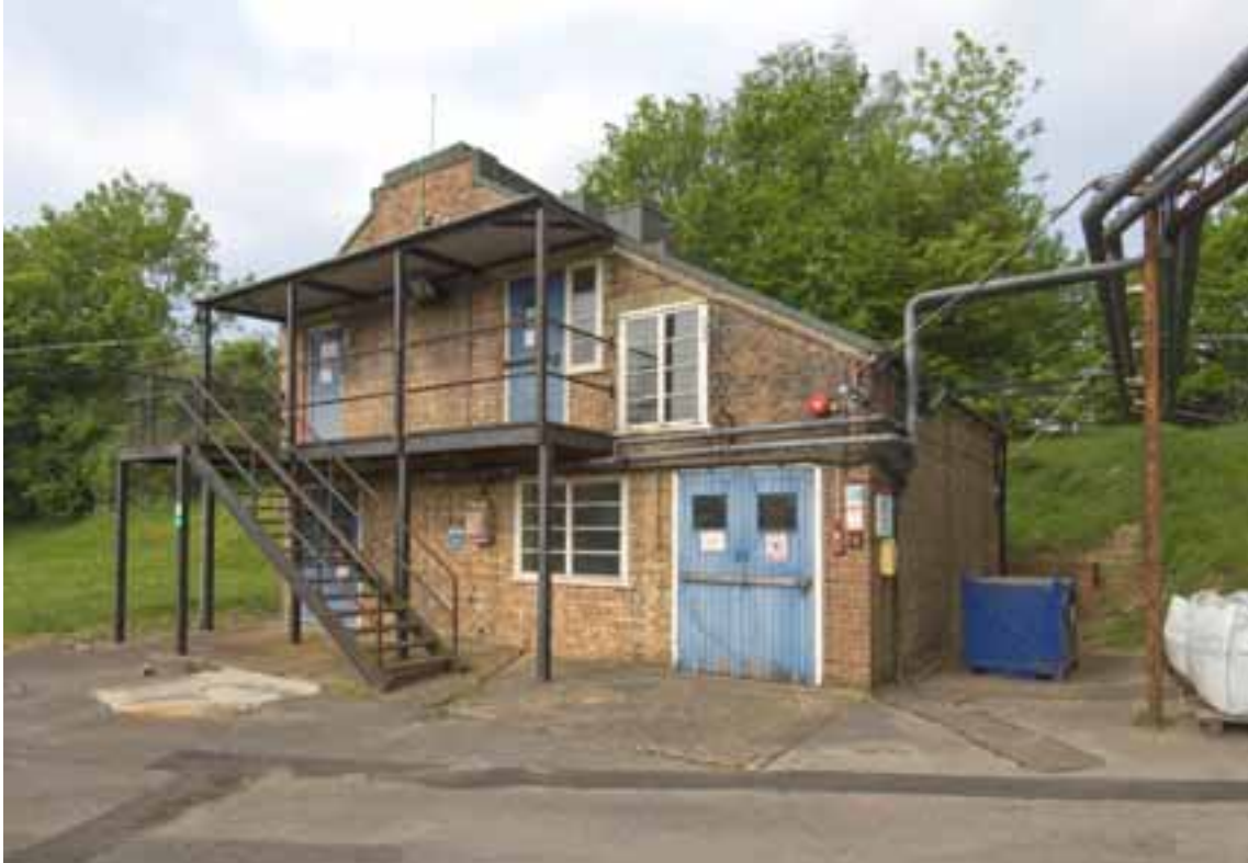
Figure 4: Experimental filling shed F11 erected in 1938 for filling cordite rocket motors.