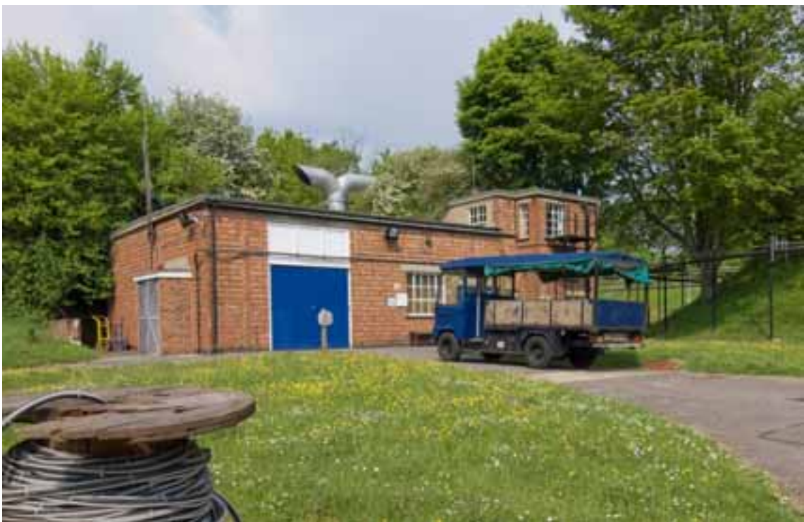
Figure 8: Detonation Chamber F17 designed in August 1947. © English Heritage DP060573