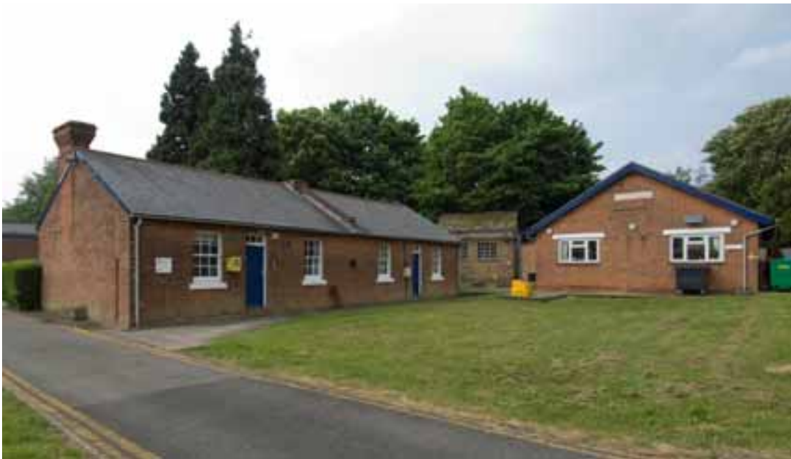
Figure 2: Late 19th century Caretaker's Cottage A14 and to the right the Tool Shed A13.

In 1890, the War Office bought 3 acres of land at Halstead, and in the following year another 6¾ acres. Plans for the fort were drawn up by 1894, and construction probably took place between 1895 and 1897 (Griffiths 1984, 4). The London Defence Positions scheme survived for about a decade, but by 1906 plans were put in place to dismantle the system. During the First World War, a laboratory (F14) was built inside the fort, perhaps for ammunition inspection and in 1920 a storehouse was built outside the fort. A year later the fort was sold to a retired army colonel, who lived in the laboratory. The cottages were let, and the remainder of the site was used as a campsite for the Territorial Army, Boy Scouts, Girl Guides, and accommodation for destitute refugees (Griffiths 1984, 3-4).