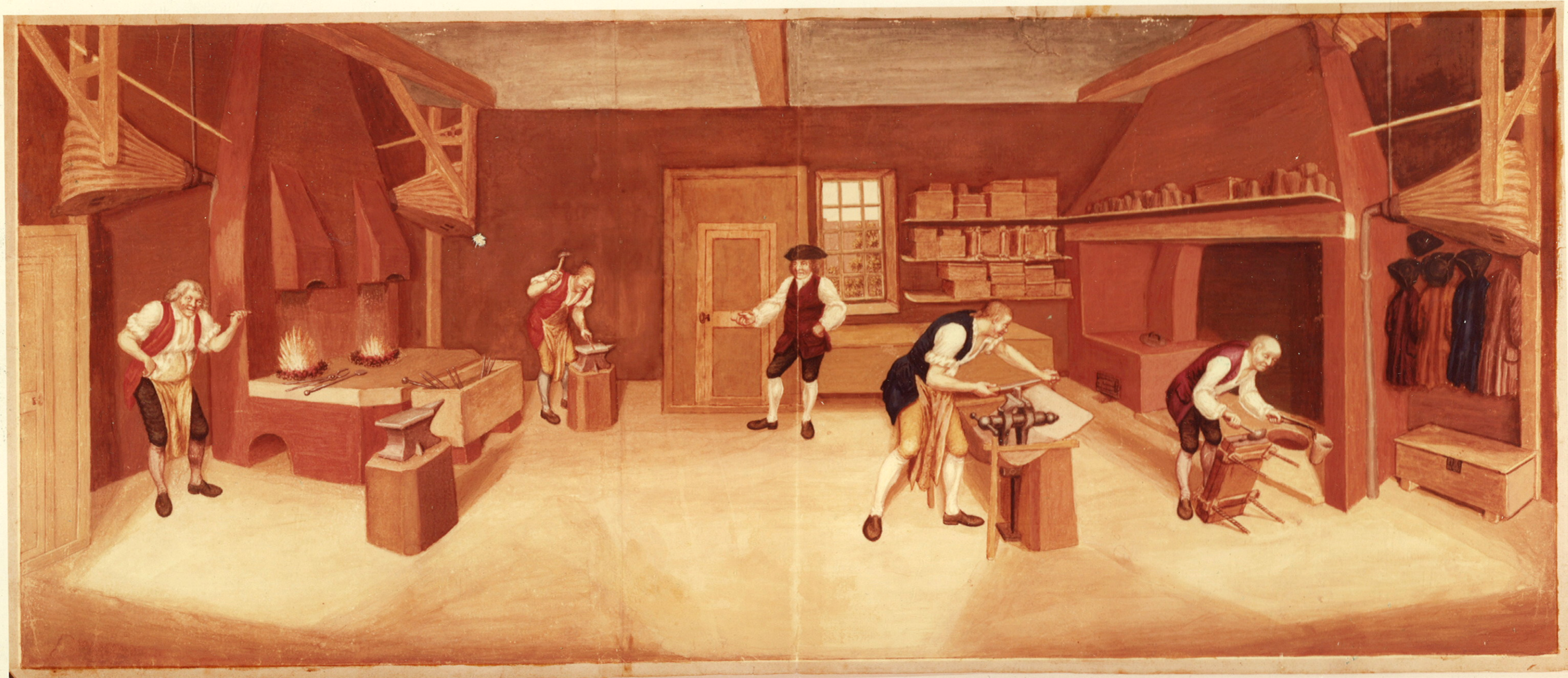
Royal Laboratory circa 1750 The Blacksmith Shop from original in National Maritime Museum