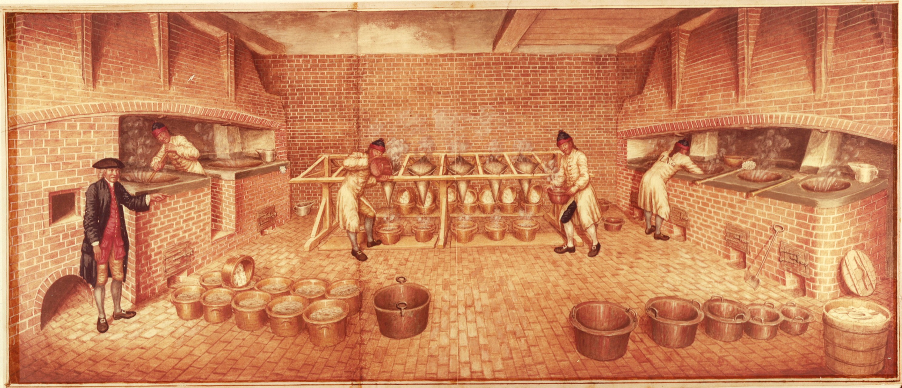
Royal Laboratory circa 1750 Refining saltpetre - the removal of insolubles by filtration of the saturated solution through canvas from original in National Maritime Museum