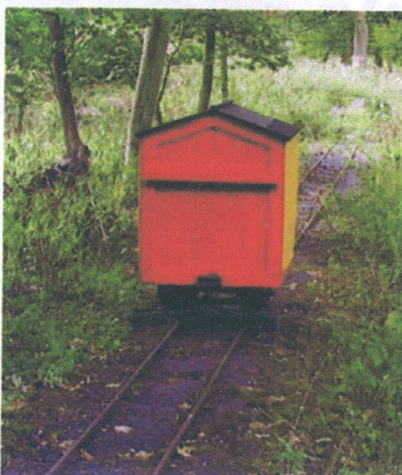
Right: A restored gunpowder wagon on original track.

Open weekends and bank holidays until September 12. Group bookings available weekdays, throughout the year.