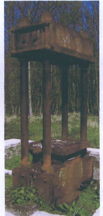
The 70 ton per sq. ft. press. 44 people lost their lives between 1858 and 1870 in this dangerous operation.