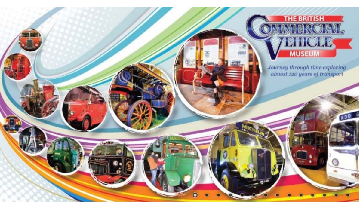
Welcome to the British Commercial Vehicle Museum Trust

This remarkable museum brings the compelling story of commercial vehicles to life. From the bygone days of horse drawn carriages through to the state of the art power trucks you will discover a visually rich array of buses, fire engines, delivery trucks and even a very unique lawnmower.