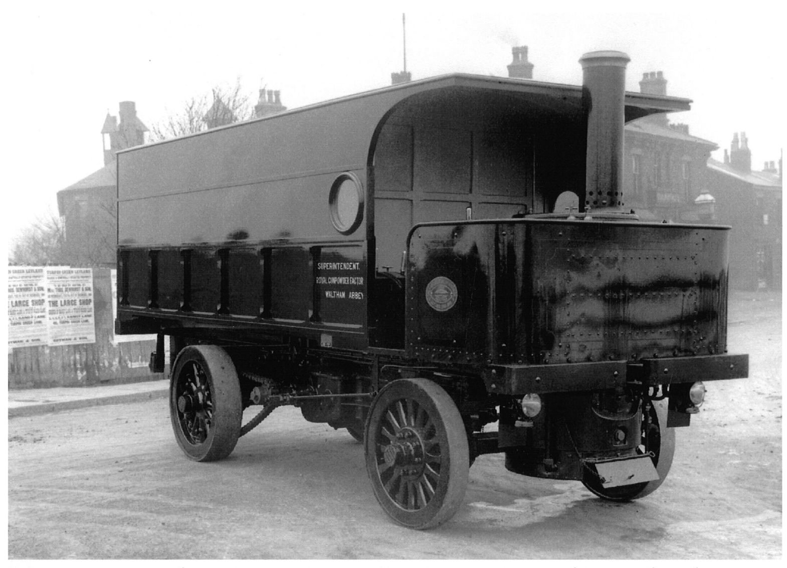
A Lancashire Steam Motor Co. Lorry pictured in Leyland, Lancashire, prior to delivery at Waltham Abbey, Circa Early 1900's