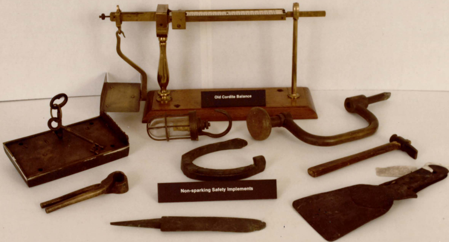
Old Cordite Balance