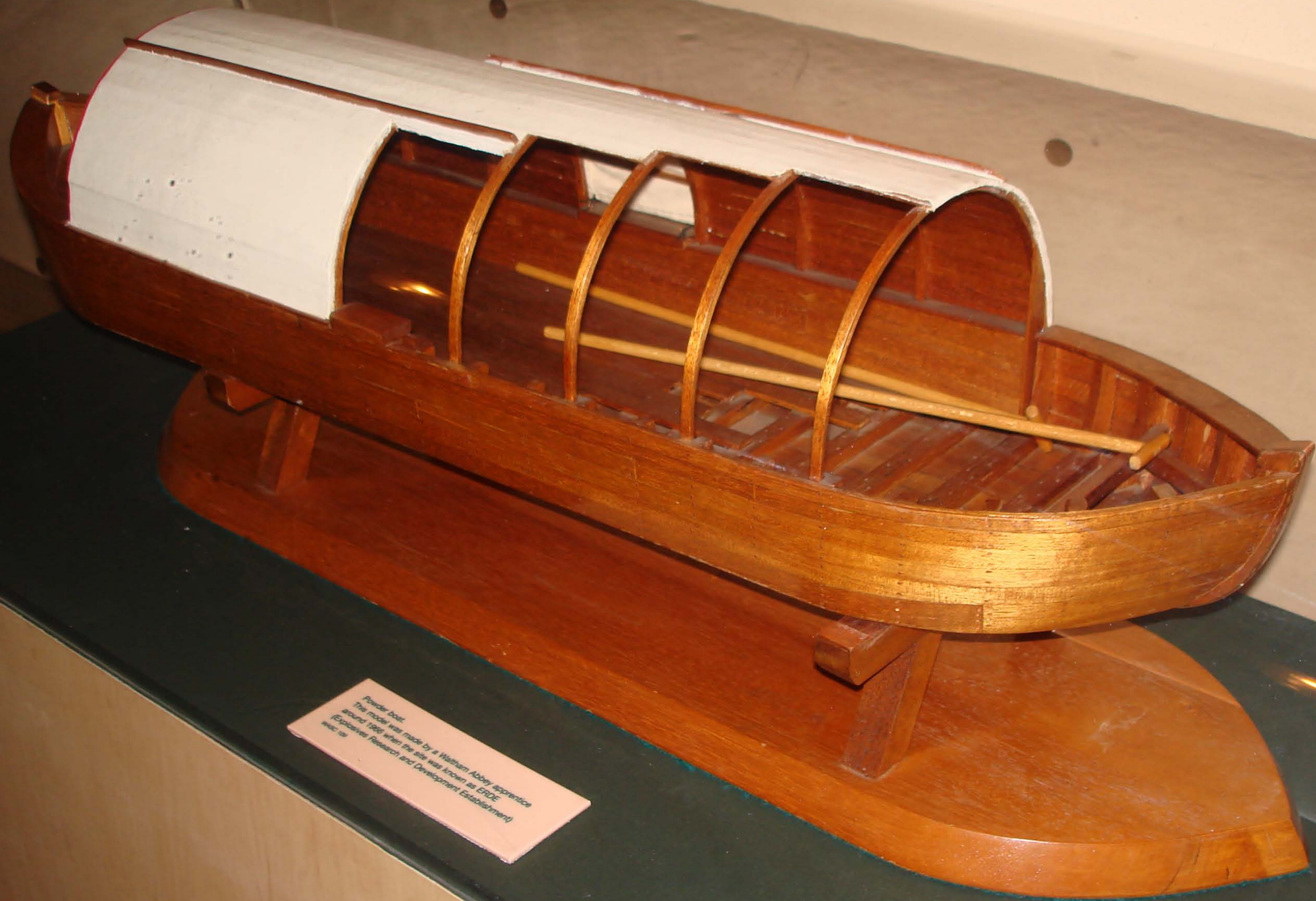
Powder boat. The model was made by a Watlington Abbey apprentice around 1860 when the site was known as ERDE (Explosive Research and Development Establishment) WASC 10