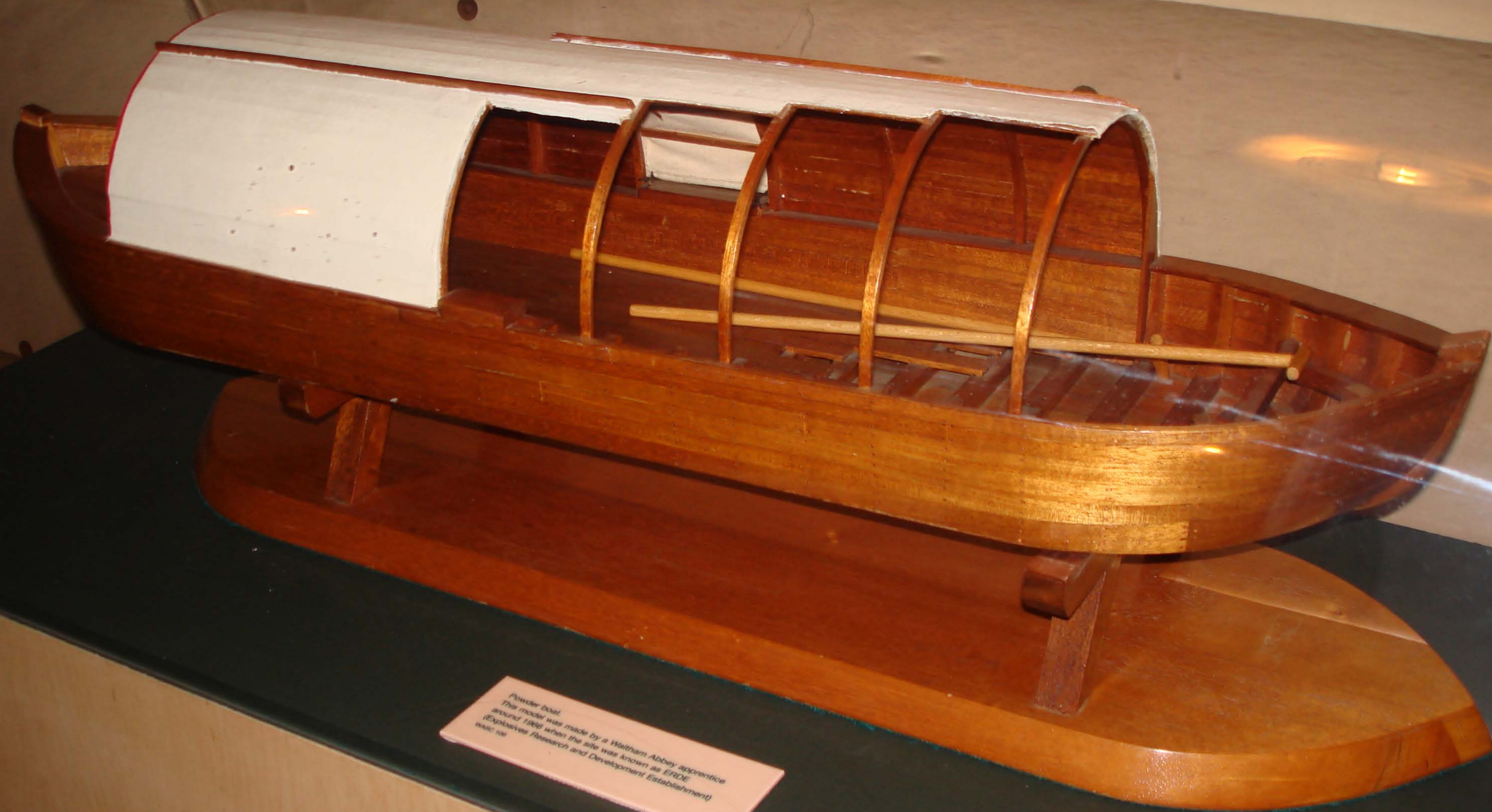
Powder boat The model was made by a Waltham Abbey apprentice around 1880 when the site was known as ERDE (Explosives Research and Development Establishment) WASC 00